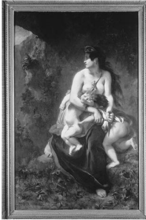
1. Delacroix's Medea: a hunted animal